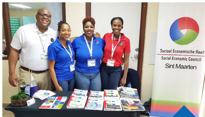
Secretary-General and staff at the 2018 SMILE conference

On November 6th, 2018 the SER was invited by the Parliament of Sint Maarten to present its 2017 Annual report. In this meeting with Parliament the SER discussed its work and challenges. The SER urged Parliament to call on government to begin an immediate review of the law regulating the SER's functioning. Broadening the scope of the Council's work is needed to allow for a closer working relationship in issuing advices to the legislature.