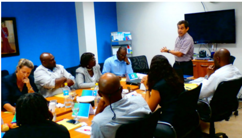
SER’s two-day training course on Human rights.

In June SER board as well as the staff attended the Tax Summit entitled: “The road to a smart state of the art tax administration”. This summit was organized by the Ministry of Finance.