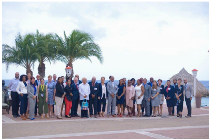
In picture: delegates of the SERs of the Dutch Caribbean