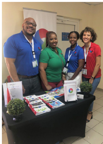
Team SER at the 2019 SMILE conference

On October 26 th , 2019, the SER participated for the second time in the innovative networking conference SMILE. The conference was mainly aimed at the private sector and non-governmental organizations, but professionals working in governmental institutions and interested students also joined to learn, gain inspiration and make use of network opportunities.